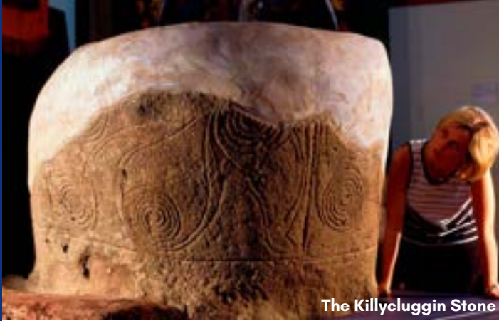
The Killycluggin Stone