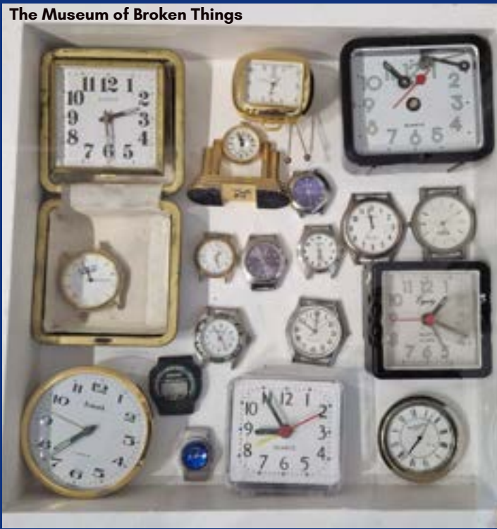
The Museum of Broken Things

Other ancient displays include Neolithic axe heads, bronze age weapons, medieval jewellery and Sheela-na-gigs, stone carvings steeped in mystery and symbolism.