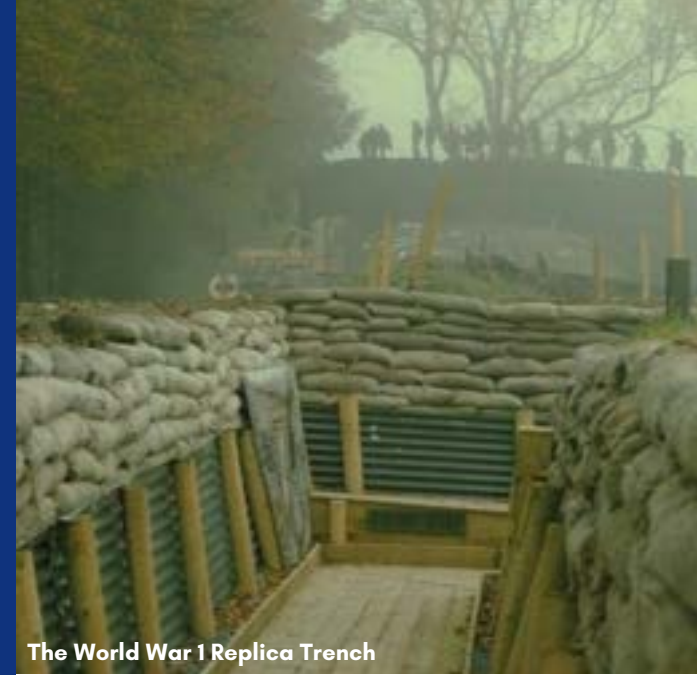
The World War I Replica Trench